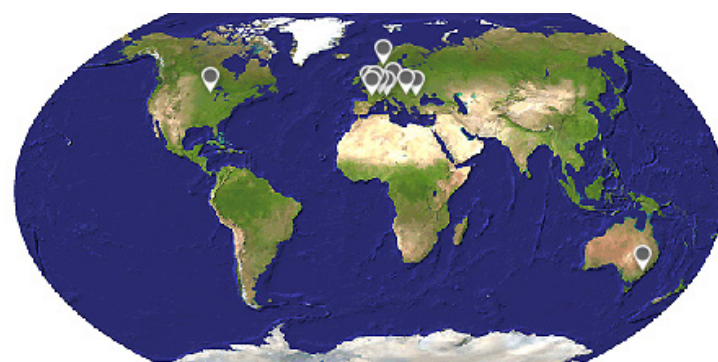
Geographical distribution of the institute founding members

Altogether, achieving these objectives require a systems approach strategy.